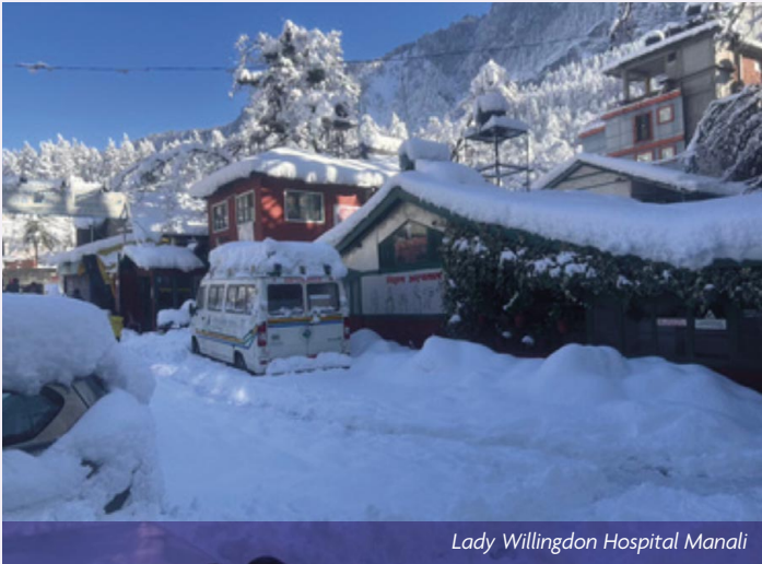
Lady Willingdon Hospital Manali

High in the Himalayan foothills, Lady Willingdon Hospital continues its long tradition of providing compassionate medical care to remote mountain communities. Recent equipment upgrades have significantly strengthened services, allowing the hospital to meet urgent and complex health needs for people who previously had few options.