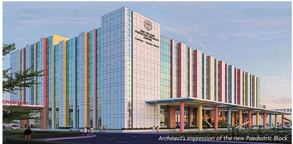
Architect's impression of the new Paediatric Block

CMC is also expanding specialist services. An Advanced Neurology Centre is being established, and the Vellore Destitute Healthcare Project (a partnership with the police, the Low Cost Effective Care Unit, and palliative care services) is reaching some of the most vulnerable in society.