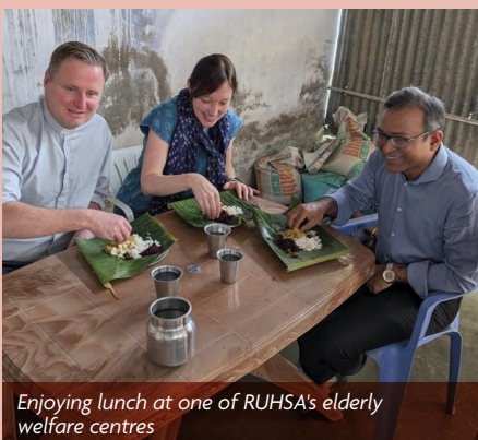
Enjoying lunch at one of RUHSA's elderly welfare centres