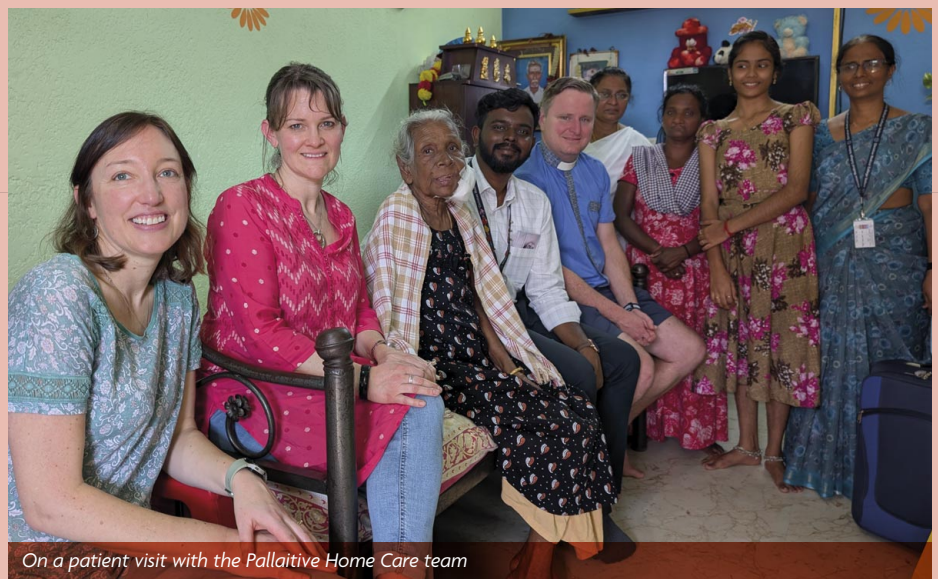
On a patient visit with the Palliative Home Care team

India overwhelms the senses. The sights of extreme freneticism, the aromas of curried