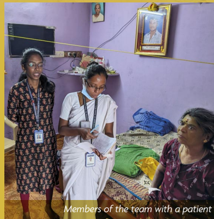
Members of the team with a patient

Alongside palliative care, the project also provides cervical cancer screening. Pre-cancerous lesions are treated locally using thermal ablation, while more complex cases are