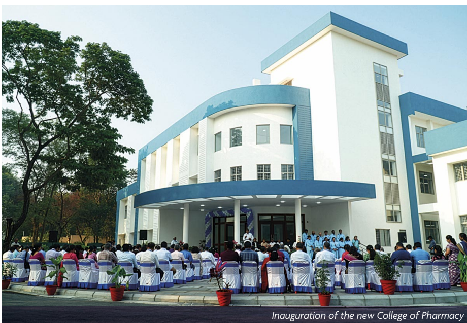
Inauguration of the new College of Pharmacy

Across campuses and initiatives, CMC Vellore remains committed to excellence in care, education, research, and compassionate service, seeking always to meet growing needs while staying true to its founding vision.