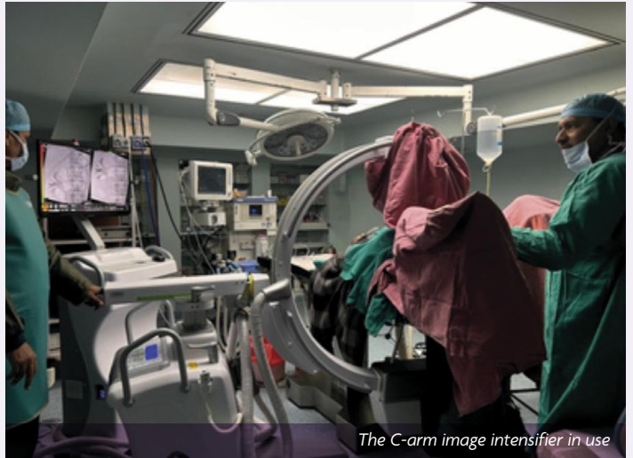
The C-arm image intensifier in use

A key addition to the operating theatre is a new C-arm image intensifier, made possible through a grant from Friends of Vellore UK. This vital piece of equipment is already transforming care, enabling procedures such as fracture repairs and urgent stenting to be performed locally. Patients no longer need to travel hundreds of kilometres to Chandigarh for these interventions, ensuring faster, safer treatment for the mountain communities the hospital serves.