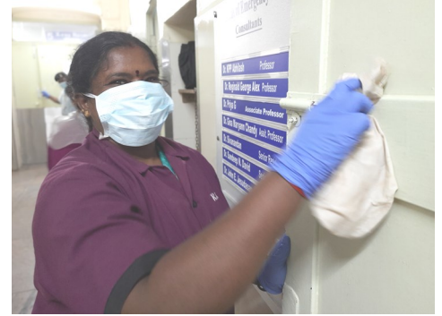
Staff cheerfully went the extra mile