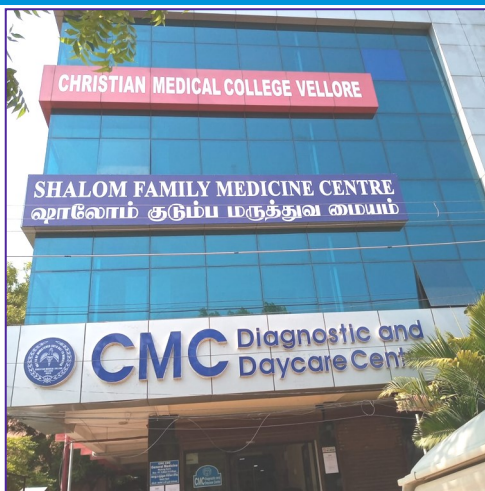
Shalom Family Medicine Centre & CDC

A second Shalom Family Medicine Centre was dedicated in June this year. Based in CMC's Diagnostic Centre in Sathuvachari, it provides outpatient services, blood collection, and diagnostic facilities such as ECGs. Minor procedures are also done and there is a well stocked pharmacy. Local residents have found it extremely useful to come here for consultations and quick treatment, especially during the pandemic. It has reduced pressure on the main outpatient areas.