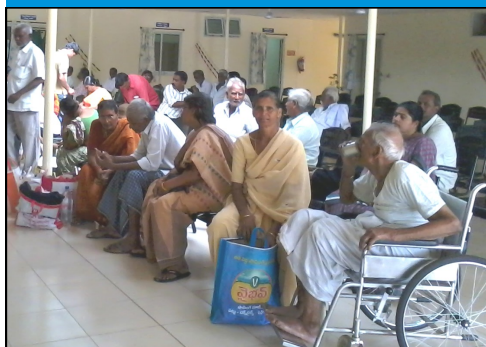
Outpatient waiting area, Chittoor

With space at a premium in the main hospital campus, people are anxious to know about progress on the two new hospitals, in Chittoor (Andhra Pradesh) and Kannigapuram (just 10km from Vellore).