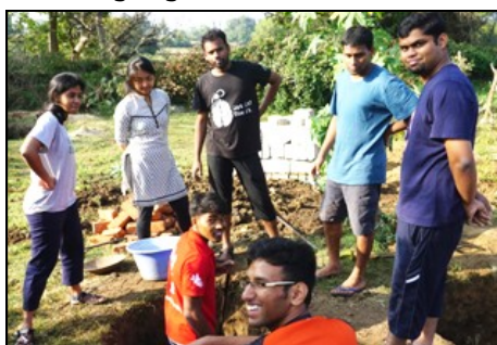
Students dig toilets: Jawadahi camp

The Jawadhi Hills area is close to Vellore but, due to poor infrastructure health and education indices are lagging behind those of the State. Pulse 2016 introduced the "model villages" project. In February staff and students had a work camp there to build toilets. The team runs an after school education scheme in the hills, and, thanks to our friends from Germany and Sweden, the summer camps give life skills training and health check ups. FoV Australia have given us a rugged four wheel drive vehicle for the tough terrain.