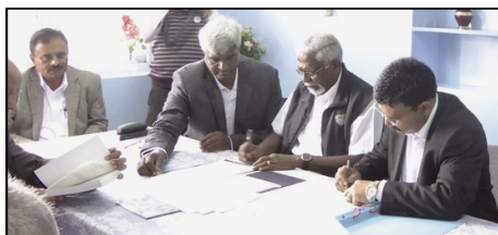
Signing the MoU with KMF

Missions Department also organises an annual conference Shiloh . Seasoned stalwarts from the mission field meet with students and staff, encouraging them to consider mission work.