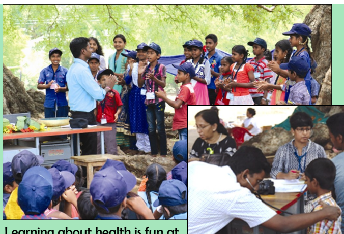
Learning about health is fun at Jawadhi Hills Summer Camps. Inset: children's health checks