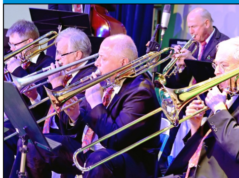
Trombone section of the Moving Big Band

The Moving Big Band (MBB) and the Gothenburg Chamber Orchestra from Sweden presented the Ida Scudder Memorial concert in February 2017, thanks to the Alumni Batch of 1957.