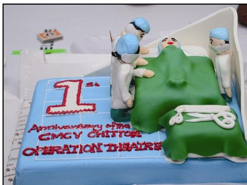
Cake to celebrate the first birthday of the operating theatres at Chittoor

Despite some setbacks (like a huge rock just below the surface, shortage of sand and—unusually for Vellore—too much water), construction has been proceeding steadily at Kannigapuram, the new centre for trauma care and super specialities like oncology, heart diseases and neurosciences. On the outskirts of Vellore this will have over 1,500 beds, both general and