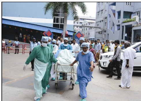
Testing patient evacuation procedures in a major incident mock drill

Ensuring that the hospital is a safe environment for patients, staff and visitors is the priority of the Safety Cell, and the safety managers in every department. Inspections and training help to prevent or reduce the impact of fires and disasters. Major incident plans and mock drills ensure that staff know what to do should the worst happen.