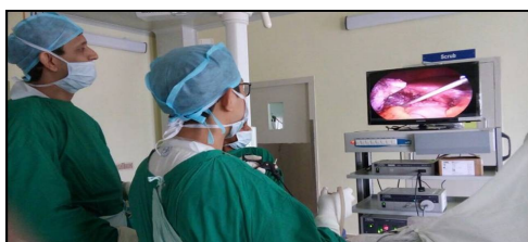
New laparoscopic suite in full use

Chittoor numbers have increased five fold over 18 months, and now cross 10,000 outpatients and 450 inpatient admissions every month.