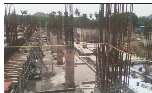
Buildings taking shape at Kannigapuram

Despite some setbacks (like a huge rock just below the surface, shortage of sand and—unusually for Vellore—too much water), construction has been proceeding steadily at Kannigapuram, the new centre for trauma care and super specialities like oncology, heart diseases and neurosciences. On the outskirts of Vellore this will have over 1,500 beds, both general and