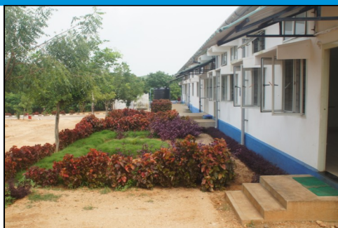
Pleasant landscaping on the spacious Chittoor campus

More than 2,000 surgeries have been performed in the excellent theatres, opened in August 2016, reducing waiting lists in Vellore.