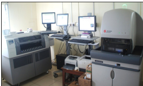
Modern, efficient laboratory at Chittoor runs nearly 12,000 tests per month