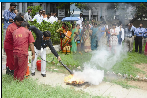
All staff undergo fire safety training

Meanwhile the Hospital Infection Control Committee is constantly monitoring the wards and theatres for signs of the microbes that can undo the good work of the medical teams by infecting recovering patients. The simplest and best thing we (staff and visitors) can do to prevent such complications is to wash our hands well after every patient contact.