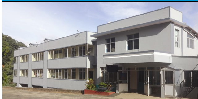
The Kotagiri Medical Fellowship Hospital, Nilgiris Hills

The purpose of the Christian Medical College isn't just to provide medical services here in Vellore, but to bring health and hope to those who most need it anywhere. Part of the way we do this through training healthcare professionals for service and then supporting them and the network of smaller mission hospitals.