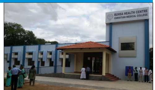
New outpatients block at RUHSA

The Rural Unit for Health and Social Affairs (RUHSA) opened in 1977, about 20km to the west of Vellore, as a community hospital and centre for economic and social development in the KV Kuppam Block. It has served this area faithfully, and is an important training centre for community health professionals and others. In July 2016 we dedicated a new outpatient block, as well as a small accident and emergency unit and a new entrance to the refurbished wards. Besides health care, RUHSA has drop in centres for isolated elderly people, and runs a community college, offering vocational training such as vehicle mechanics, tailoring, and beautician.