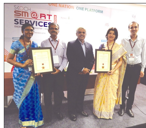
Teams from CMC's Dental I and ENT IV (Audiology) Units receive their Skoch Awards.

Hearing difficulties are often not picked up until children are two or three years old. This slows down their development and puts them at a serious disadvantage at school. Early diagnosis and intervention make all the difference. The ENT IV Audiology team screens all babies born in CMC (about 50 a day!), and provides the help needed to any with defects, so that they can develop to their fullest potential. We believe this is unique in India.