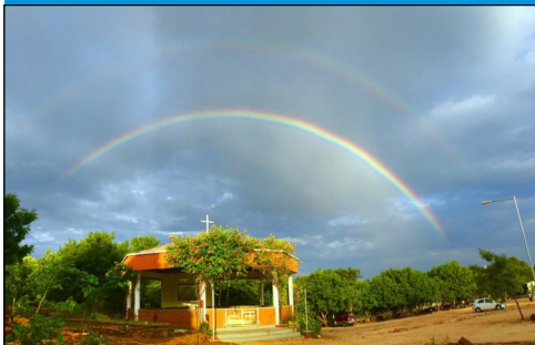
Sign of God's Promise: Double rainbow over CMC's Chittoor Campus Chapel.

There has been an outpatient facility functioning in our Chittoor Campus for several years. Now we have opened a 130-bedded hospital on this picturesque site. Many people from Andhra Pradesh will find it convenient to go there, and the state of the art operating theatres are well used. Meanwhile the growing out-patients department offers many general and specialist clinics.