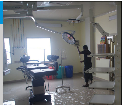
Chittoor Campus Operating Theatre: final preparations before opening

There has been an outpatient facility functioning in our Chittoor Campus for several years. Now we have opened a 130-bedded hospital on this picturesque site. Many people from Andhra Pradesh will find it convenient to go there, and the state of the art operating theatres are well used. Meanwhile the growing out-patients department offers many general and specialist clinics.